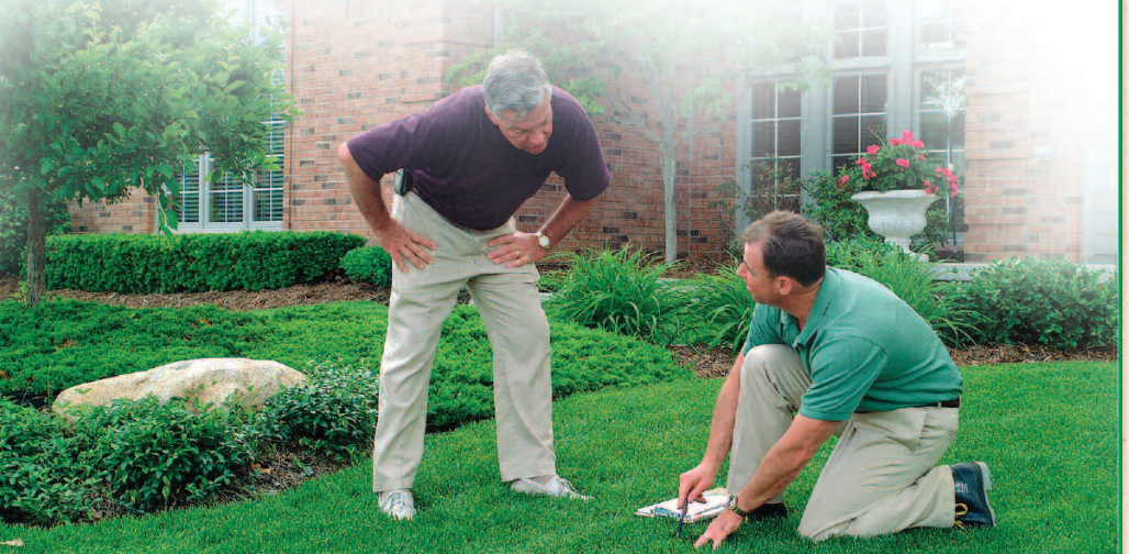
"The Finest Lawn Service Available"

The tree and shrub application today consisted of dormant oil and insecticide. This application utilizes oils to help minimize the use of pesticides later in the year. This oil actually smothers insects and their eggs. By using a sticking agent, these oils remain on the plants longer, thereby increasing their length of effectiveness. This helps prevent damaging populations next season.